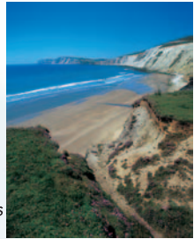
View along South West Coast